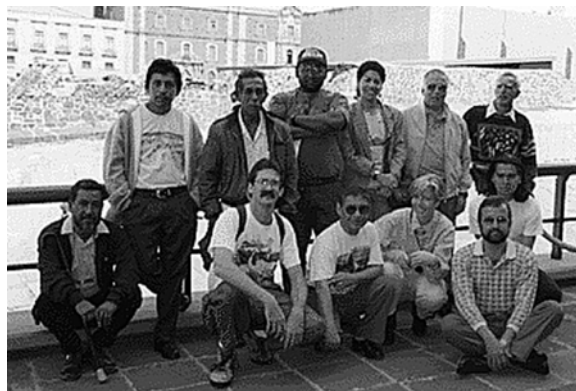
Participants visit the Plaza Mayor, Mexico

During the week of January 20-25 a group of 28 experts from Belize, Guatemala, Mexico and the United States met in Mexico City to help map out the future of the El Pilar Archaeological Reserve for Maya Flora and Fauna. Underwritten by the Ford Foundation, the meeting included representatives of the local villagers, archaeologists, government representatives, biologists, ecologists, community development planners, attorneys and conservators.