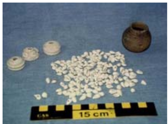
Artifacts from the Burial at Str. 5

Once again, outside of the beautiful intact architecture we did not find anything earthshaking but what we did find was exciting for everyone involved. The Tzunu'un crew is rightly proud of a small jar, three spindle whorls and a large quantity of small olive shells (they had been strung or sewn onto something) found in associated with the burial assemblage of Str. 5.