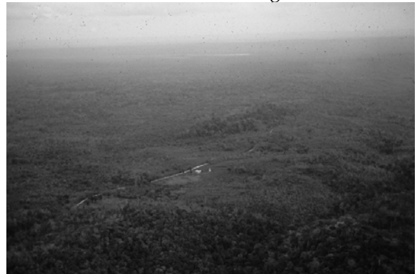
El Pilar Archaeological Reserve from the Air