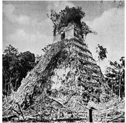
Uaxactun in the year 1904