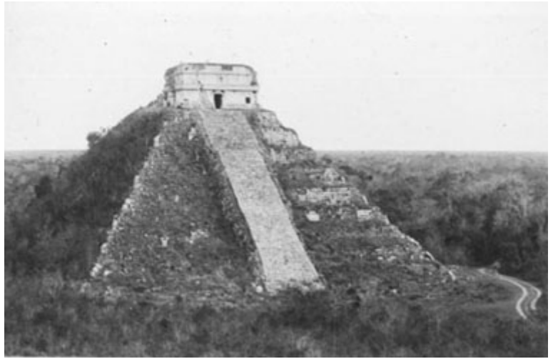
Chichen Itza: Year 1920