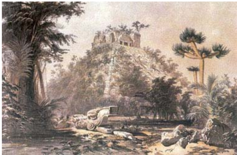
Chichen Itza: Year 1840