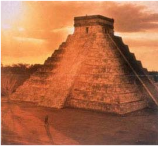
Chichen Itza: Year 2000